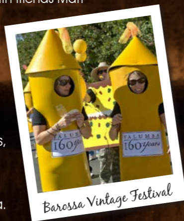
Barossa Vintage Festival

Yalumba wines 1st prize in the Festival Grand Parade, Winery Section, featuring 160 employees, families and pets, birthday cake and party poppers trekking the traditional 8KM parade path between Nuriootpa and Tanunda.